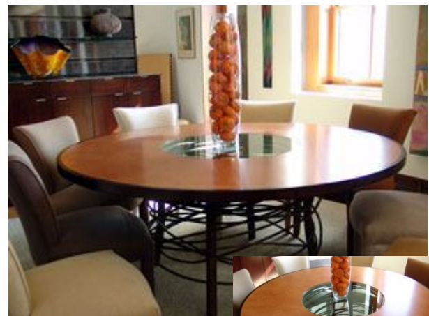
Dining table constructed of Flat Cut Maple with Ebony edging and a glass insert in the center