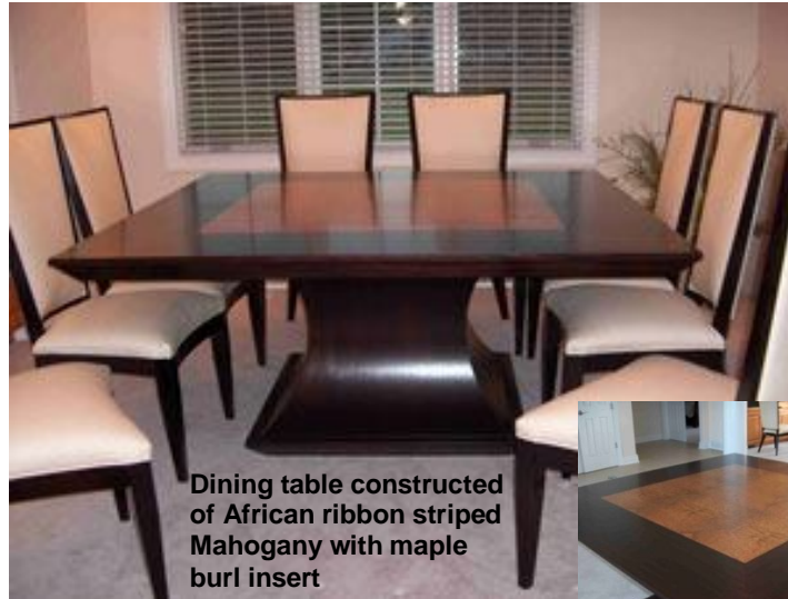
Dining table constructed of African ribbon striped Mahogany with maple burl insert