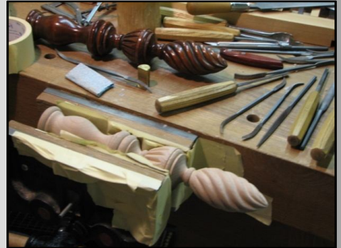
Finial taken off antique bed and is in the process of matching the original

You can actually bring a piece of old furniture back to life with minimal effort in many cases. The finials shown in the picture are of one original finial taken off an antique bed, two were carved to duplicate the original one. Once they were completed it's hard to tell the difference.