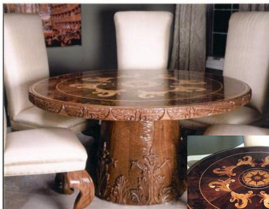
Dining table constructed of solid American Black Walnut, Walnut Burls Steamed Beech, Un-Steamed Beech, Northern hard Maple, and Curly Maple hardwoods

With the Holiday's approaching, spending quality time together is important to many families. Mealtime is an excellent opportunity for strengthening family relationships. With today's busy lifestyles and hectic schedules, it is easy for parents to overlook the importance of having meals together as a family on a regular basis. Creating meals together offers the perfect opportunity for spending quality time with your loved ones. You can prepare a meal together, while sharing stories and winding down for the day, using this important time to communicate and understand each other better.