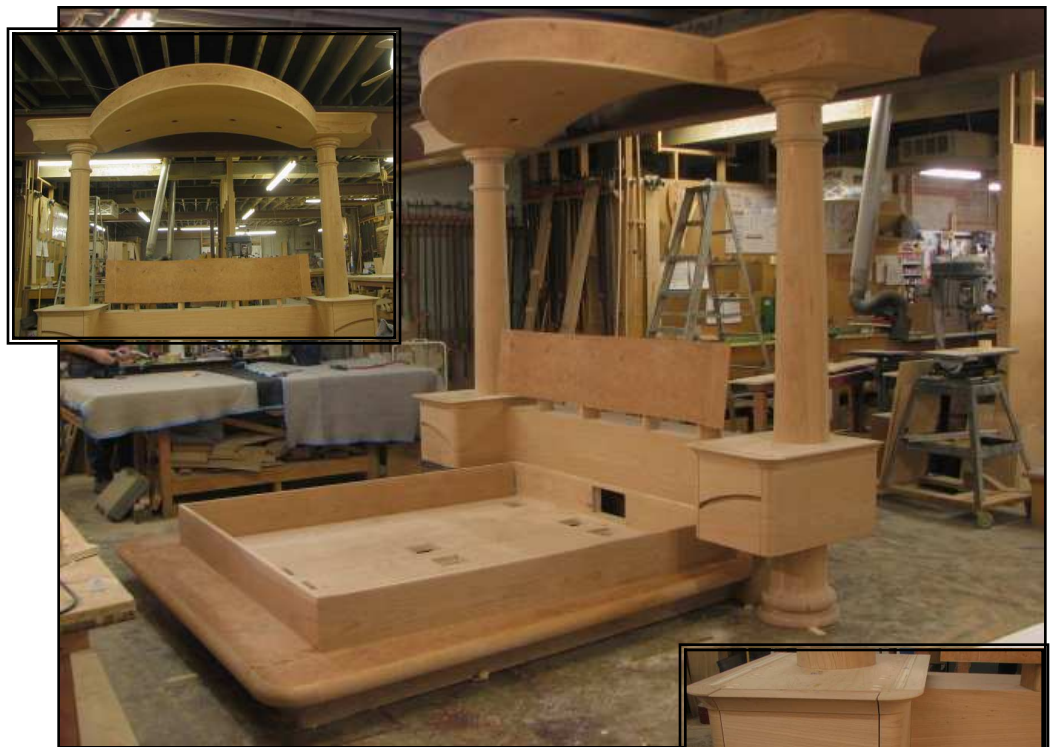
Unfinished Solid Cherry and Maple Burl Shown in shop prior to entering finishing booth Shipping to Louisiana

We live in a world where lemonade is made from artificial flavoring and furniture polish is made from real lemons.