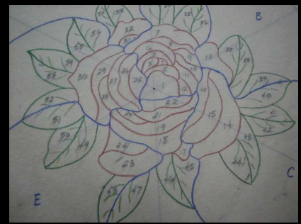
Completed center rose and template ^^(Shown above) ^^